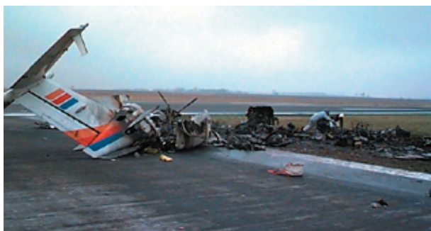
Remains of the Beech 1900C after the collision and ensuing fire.

The NTSB determined that the probable cause of the accident was the failure of the pilots of the King Air "to effectively monitor the CTAF or to properly scan for traffic..."