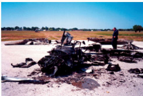
Remains of the Cessna 152 and Cessna 172 after the accident.