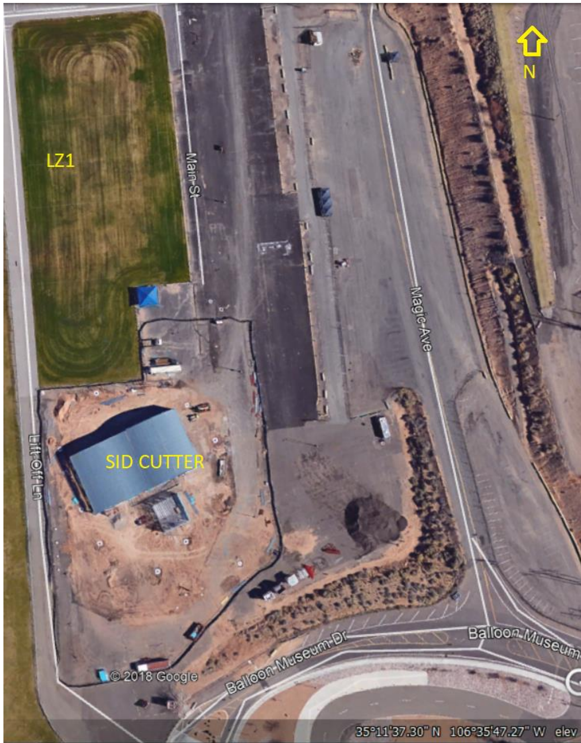
LZ Photo 1