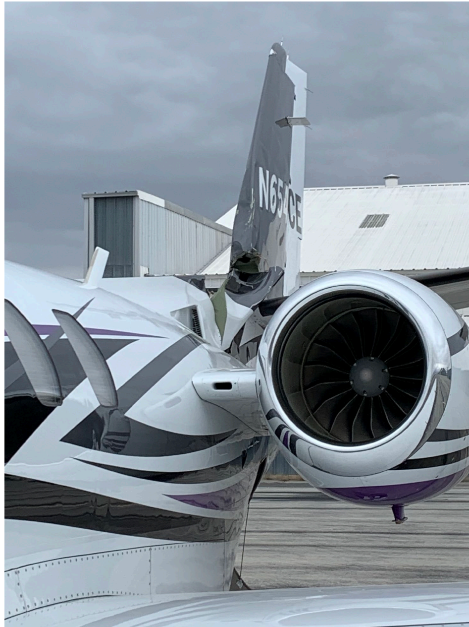
Photo 3 – Ground view of the damaged empennage.