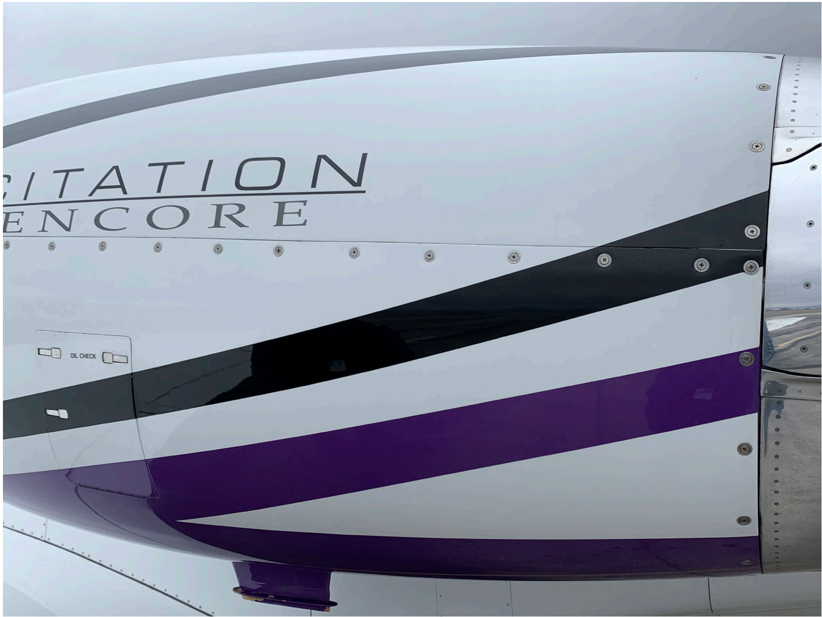
Photo 5 – View of the exemplar upper and lower left side engine cowlings.