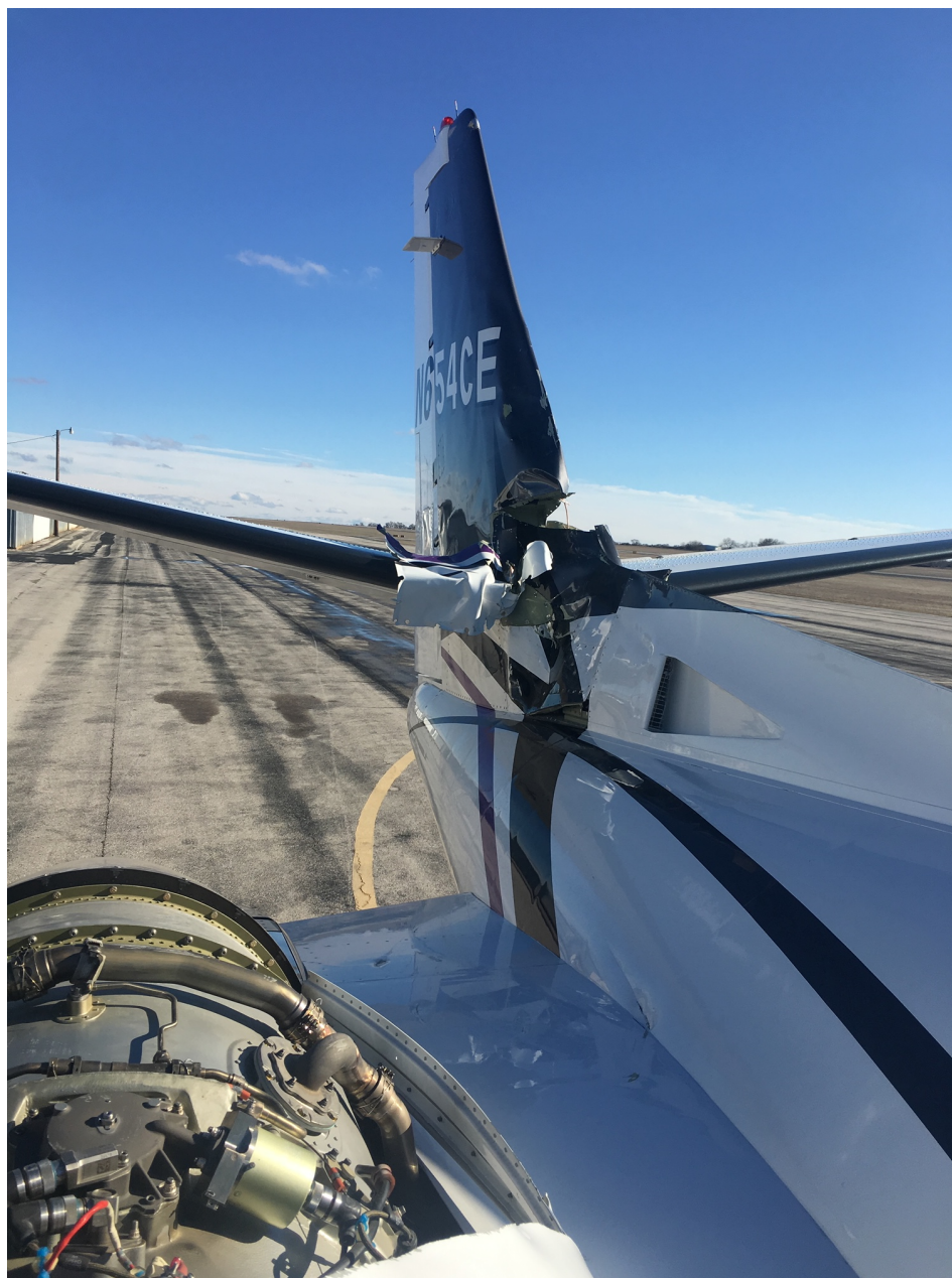
Photo 1 – Elevated view of the damaged empennage.