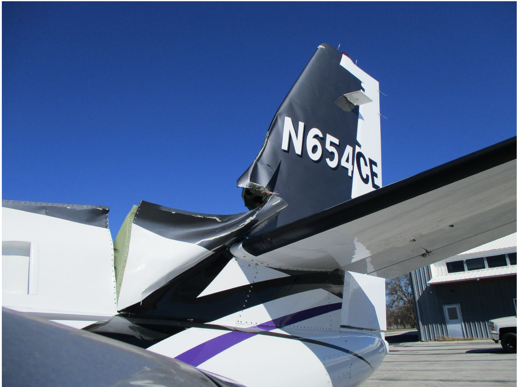
Photo 4 – Ground view of the damaged empennage (courtesy of the Federal Aviation Administration).