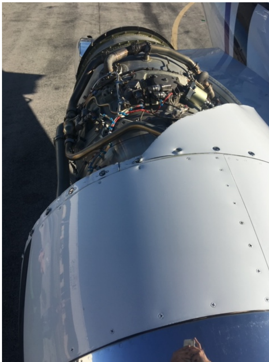
Photo 2 – Elevated view of the right side engine and fractured upper cowling (courtesy of the operator).