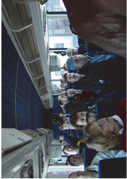
Airport Runway Tours