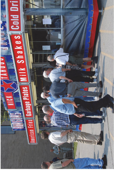
Nick Tahou Hots