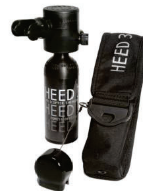
Emergency Breathing Device Usage