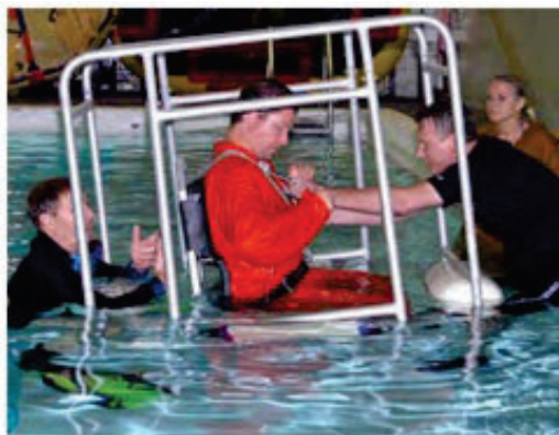
Escape a simulated submersed aircraft