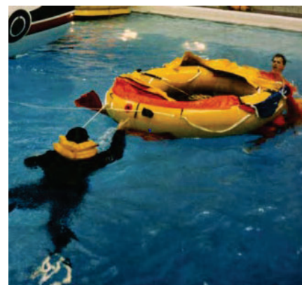
Raft boarding techniques