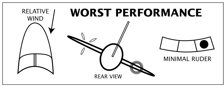
Figure 2. The result of bank-only correction.